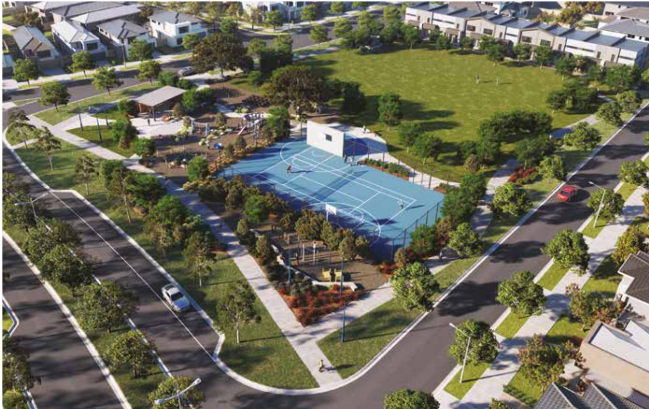
Artist's impression. Ace Reserve, one of Midtown's two upcoming parks.