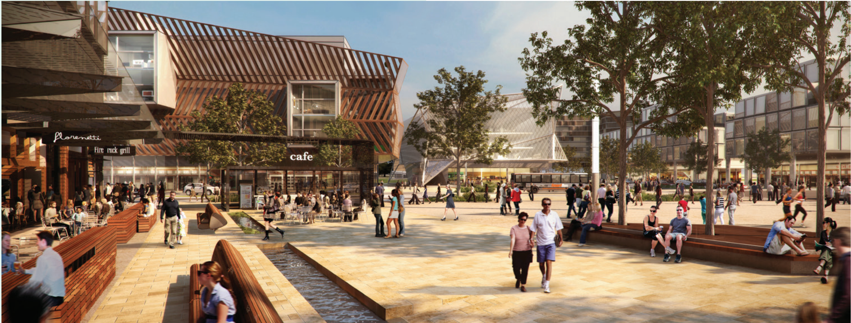
Artist's impression. Merrifield City Centre.