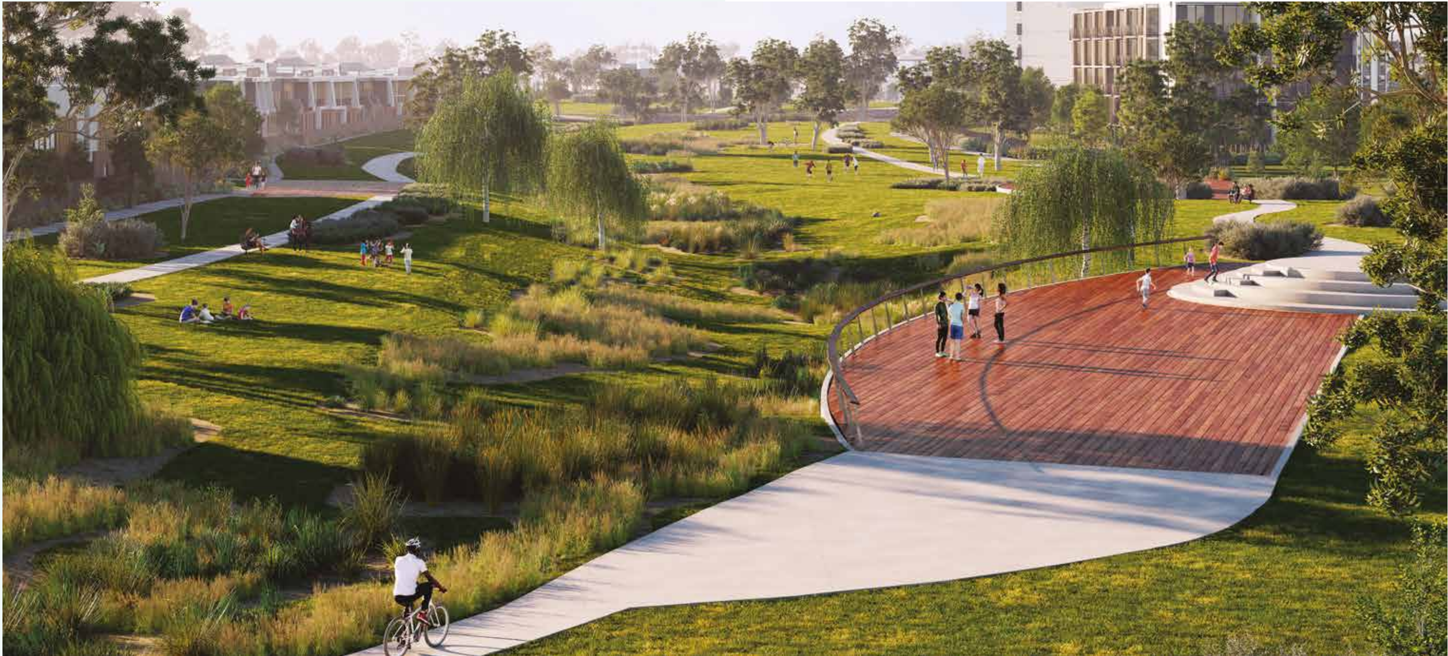
Artist's impression. Linear Park.