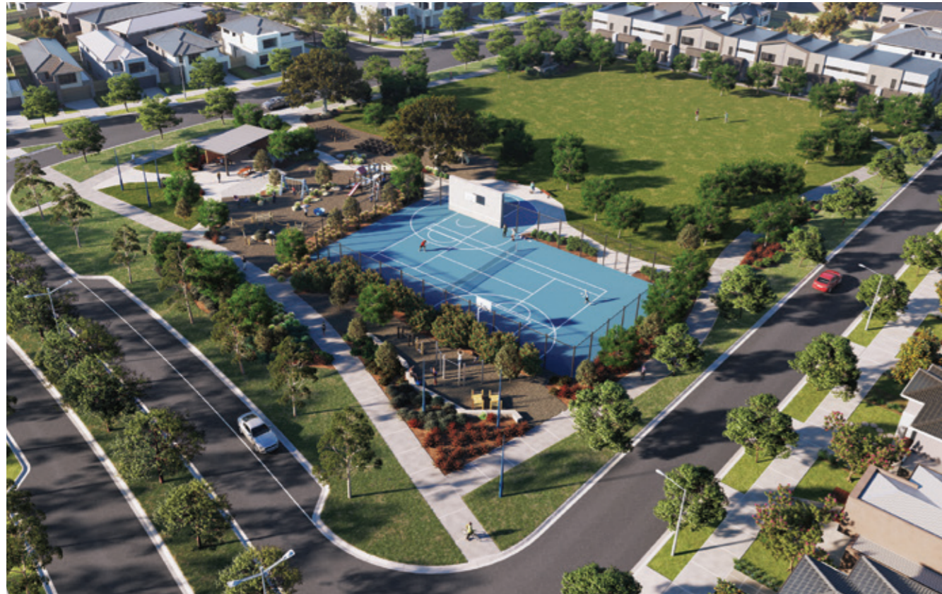
Artist's impression. Ace Reserve, one of Midtown's two upcoming parks.