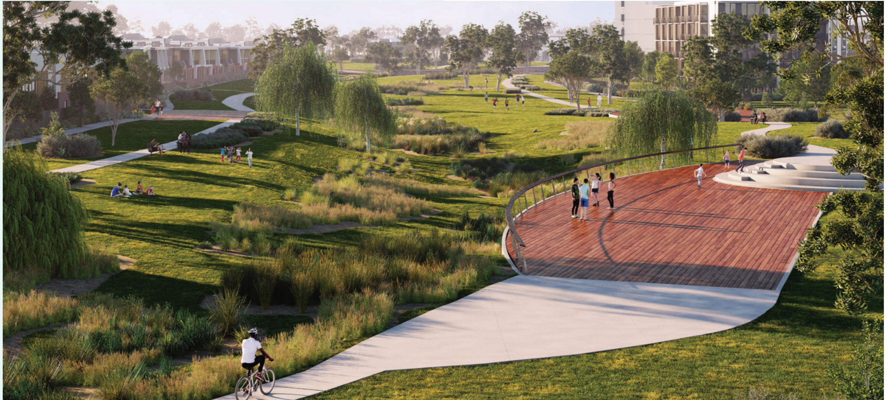
Artist's impression. Linear Park.