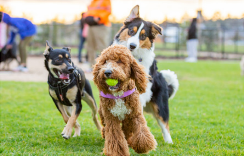
MERRIFIELD DOG PARK.