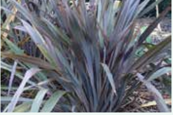
Bronze Baby N.Z. Flax Phormium 'Bronze Baby'