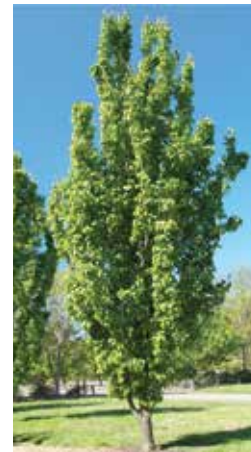
Callery Pear Pyrus calleryana 'Capital'