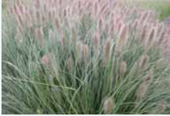
Swamp Foxtail Pennisetum alopecuroides 'Nafay'