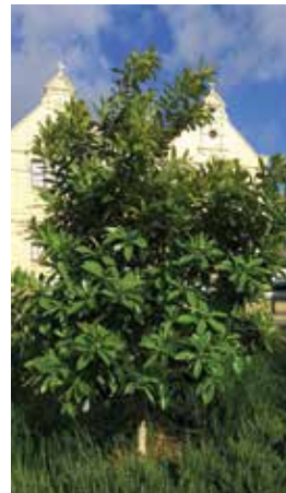
Kanooka Tristanopsis laurina 'Luscious'