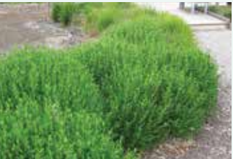
Correa Ivory Lantern Correa glabra