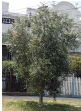
European Olive Olea europaea