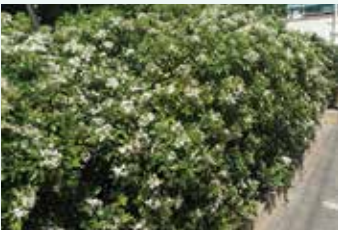
Mexican Orange Blossom Choisya ternata