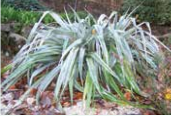
Astelia Silver Spears Astelia chathamica 'Silver Spears'