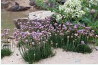
Thrift Armeria maritima