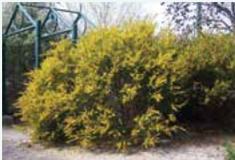
Little Nugget Wattle Acacia Pravissima 'Little Nugget'