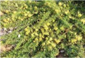
Grevillea Gold Cluster Grevillea juniperina 'Gold Cluster'