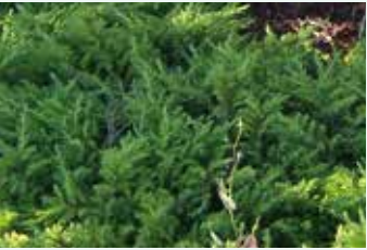
Shore Juniper Juniperus conferta