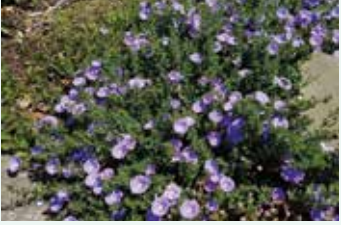
Ground Morning Glory Convolvulus mauritanicus