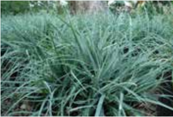
Blue Sedge Carex flacca