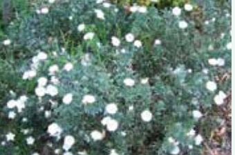
Silver Bush Convolvulus cneorum