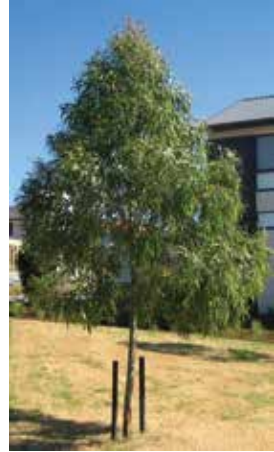
Lemon Scented Gum Corymbia citriodora 'Scentuous'