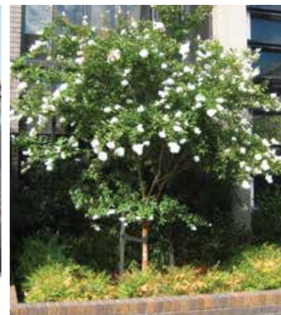
Crepe Myrtle Lagerstroemia indica x L. faurieri 'Natchez'