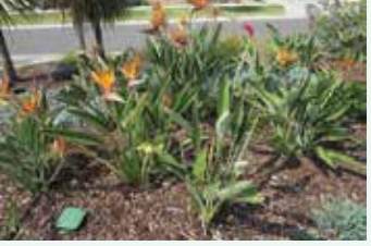
Bird of Paradise Strelitzia reginae