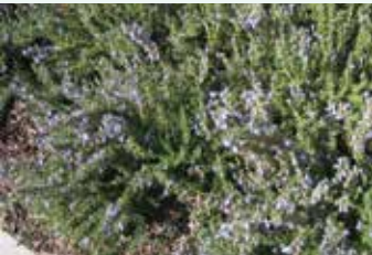
Prostrate Rosemary Rosmarinus officinalis prostratus