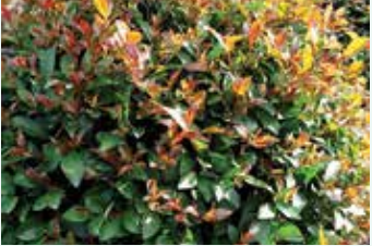
Lilly Pilly Aussie Copper Syzygium australe 'Aussie Copper'