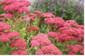
Autumn Joy Sedum Sedum 'Autumn Joy'