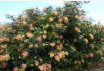
Peaches & Cream Grevillea Grevillea