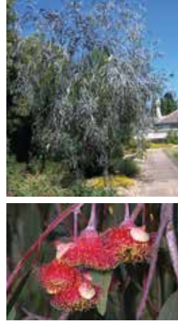
Eucalyptus caesia 'Silver Princess'