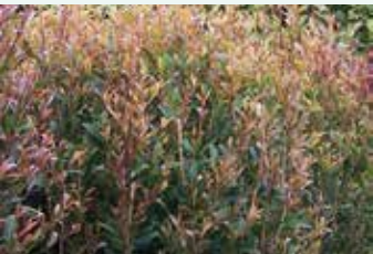
Lilly Pilly Dwarf Acmena smithii 'Hot Flush'