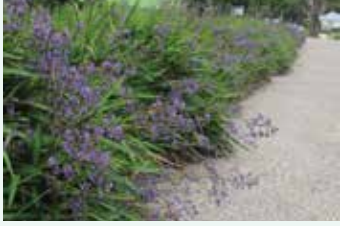
Native Flax Dianella caerulea 'Little Jess'