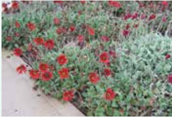
African Daisy Flame Arctotis 'Flame'