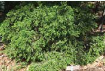
Dwarf Sticky Wattle Acacia howittii 'Honey Bun'