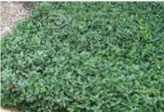
Cherry Cluster Grevillea Grevillea rhyolitica x uniperina