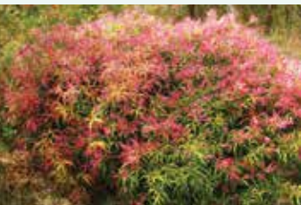
Willow-Leaf Bottlebrush Callistemon salignus 'Great Balls of Fire'