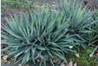
Adam's Needle Yucca filamentosa