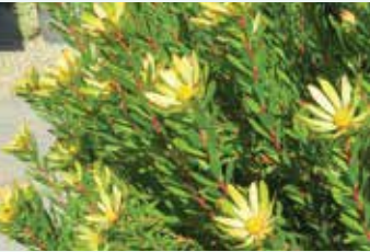
'Safari Gold Strike' Leucadendron salignum