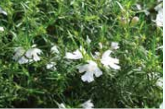
Coastal Rosemary Westringia longifolia 'Snow Flurry'