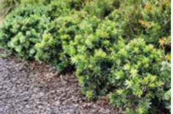
Green John Bottlebrush Callistemon viminalis 'Green John'