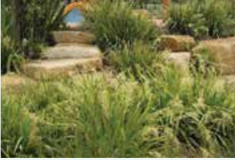
Mat Rush Katie Belles Lomandra hystrix 'Katie Belles'