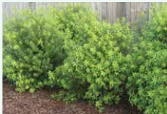
Limelight Pittosporum Pittosporum 'Limelight'