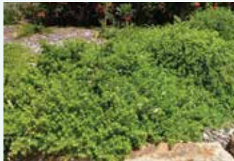
Prostrate Westringia Westringia 'Flat n Fruity'