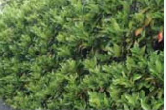
Viburnum odoratissimum 'Dense Fence'