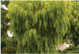
Bower Wattle 'Lime Magik' Acacia cognata