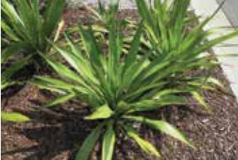
Gynea Lily Doryanthes excelsa