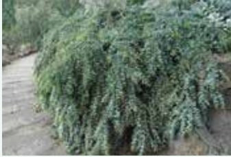
Prostrate Cootamundra Wattle Acacia baileyana 'Prostrate Form'