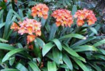
Kaffir Lily Clivia miniata