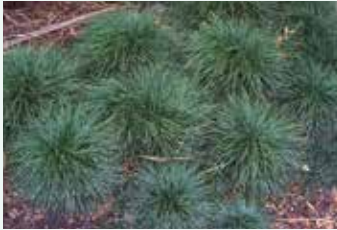
Mondo Grass Ophiopogon japonicus