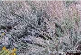
'Moon Lagoon' Eucalyptus latens