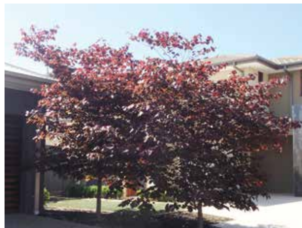
Judas Tree Cercis canadensis 'Forest Pansy'