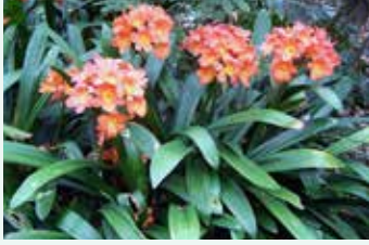
Kaffir Lily Clivia miniata