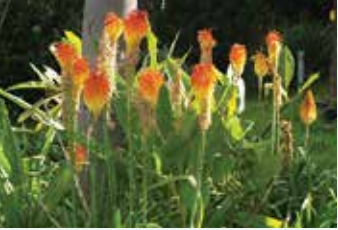
Red Hot Poker Winter Cheer Kniphofia 'Winter Cheer'