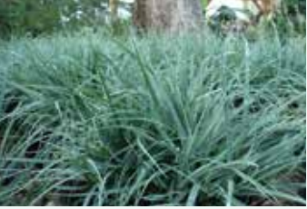
Blue Sedge Carex flacca