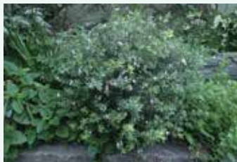
Aussie Box Westringia 'Aussie box'