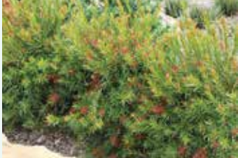
Scarlet Flame Bottlebrush Callistemon viminalis