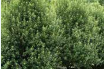
Pittosporum tenuifolium 'Green Pillar'