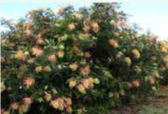
Peaches & Cream Grevillea Grevillea