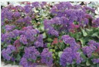
Statice Limonium perezii