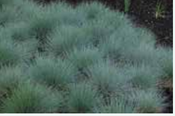
Blue Fox Fescue Festuca glauca