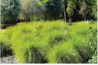
Little Pal Lomandra confertifolia