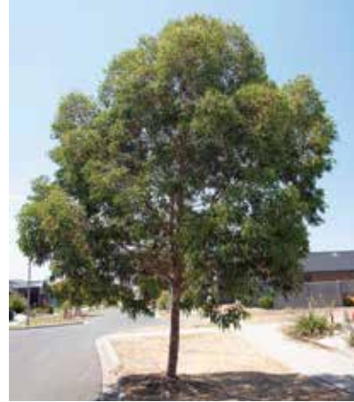
Eucalyptus leucoxylon 'Eukie Dwarf'