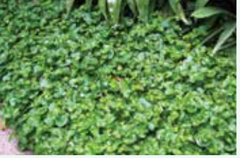
Native Violet Viola hederacea