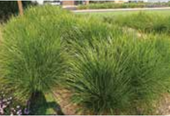
Lime Tuff Lomandra Lomandra 'Lime Tuff'