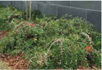
Prostrate Red Honey-Myrtle Melaleuca hypericifolia 'Ulladulla Beacon'