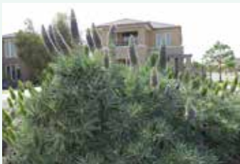
Pride of Madiera Echium candicans