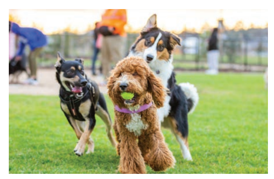
MERRIFIELD DOG PARK.