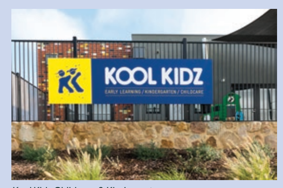
Kool Kidz Childcare & Kindergarten